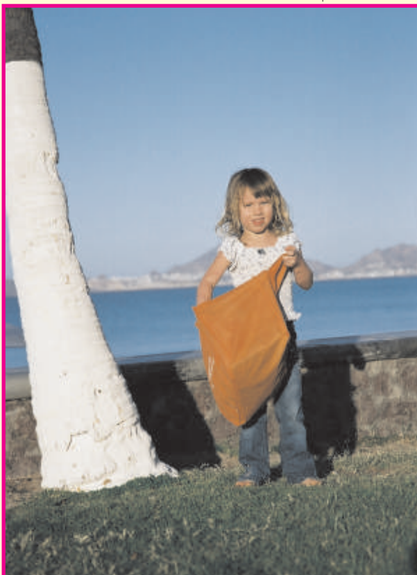
Hunting for Easter eggs among the palm trees in San Carlos.