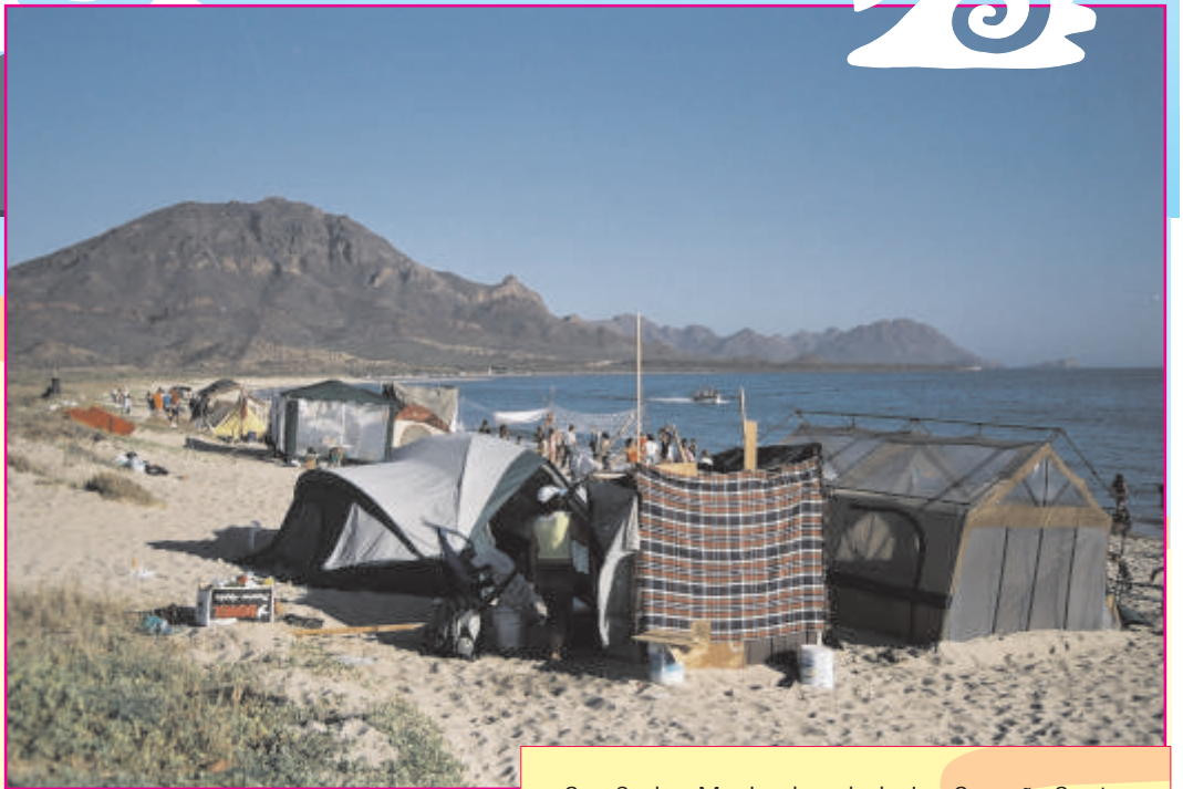
San Carlos, Mexico, beach during Semana Santa.